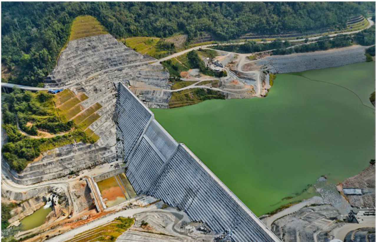
The 90-meter high dam at Ulu Jelai backs up water over a surface area of almost one square kilometer.

With its state-of-the-art technologies, Sika is making a significant contribution to challenging infrastructure projects. In large-scale projects top technologies are essential to ensure that concrete shows the required performance and can be properly processed. The Ulu Jelai hydroelectric power plant in Malaysia is a major project that has been realized with Sika products.