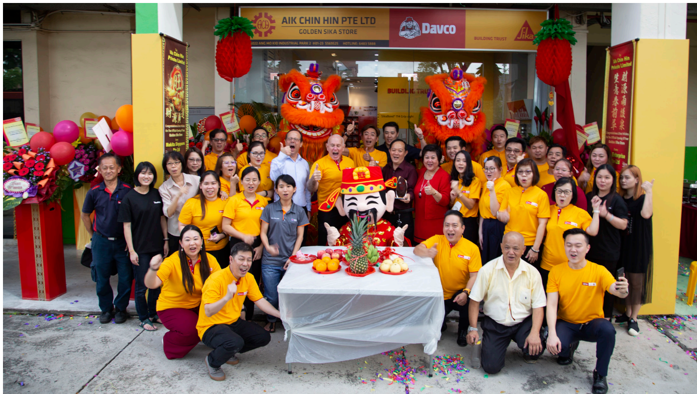
Official opening of the Golden Store, February 2020