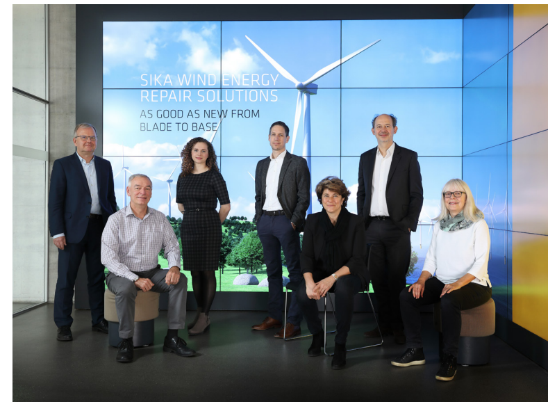
Sustainability experts from the acquired company Parex are fully integrated into Sika’s Sustainability Team

The Parex initiative, in partnership with “PUR Projet”, a French social enterprise and an expert in operating community agroforestry, reforestation, and conservation projects, is set to be established in selected countries. Objectives are the mitigation of climate change impacts, water preservation, and local community development support.