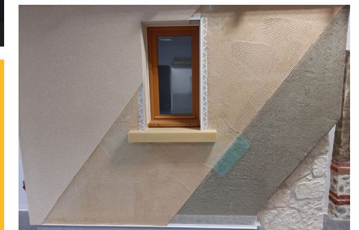
PARNATUR® is designed to lower the use of cement in construction and to reduce CO 2 emissions

12% REDUCTION OF CO 2 EMISSIONS PER TON SOLD BY 2023