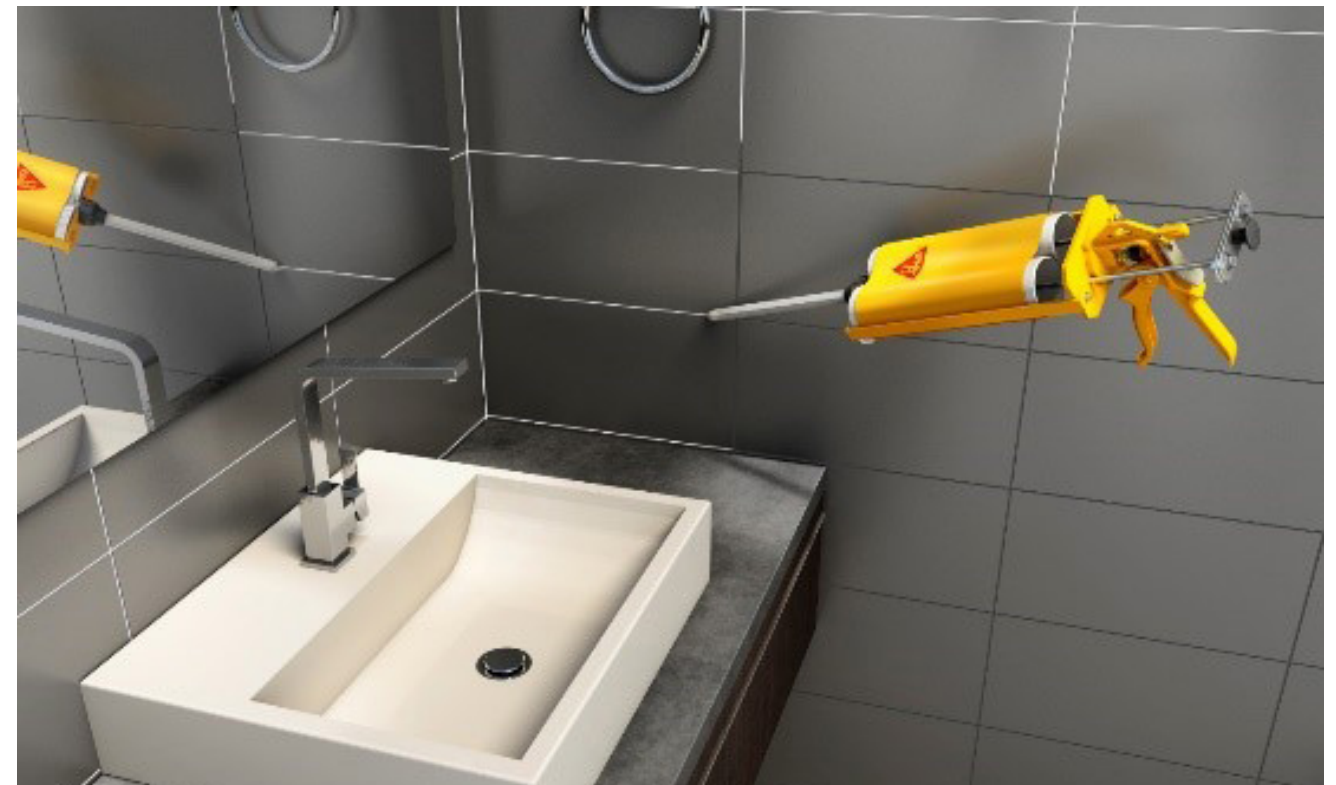
The new epoxy tile grout - easy application for an outstanding decorative result

14 MILLION+ VIEWS ON SOCIAL MEDIA OF LAST YEAR'S TILER CONTEST VIDEO