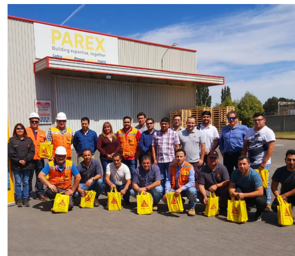
Training for Sika customers at the Parex plant

And finally, our next step is to be one company, Sika, with two strong roots - the heritage of Sika and the heritage of Parex.