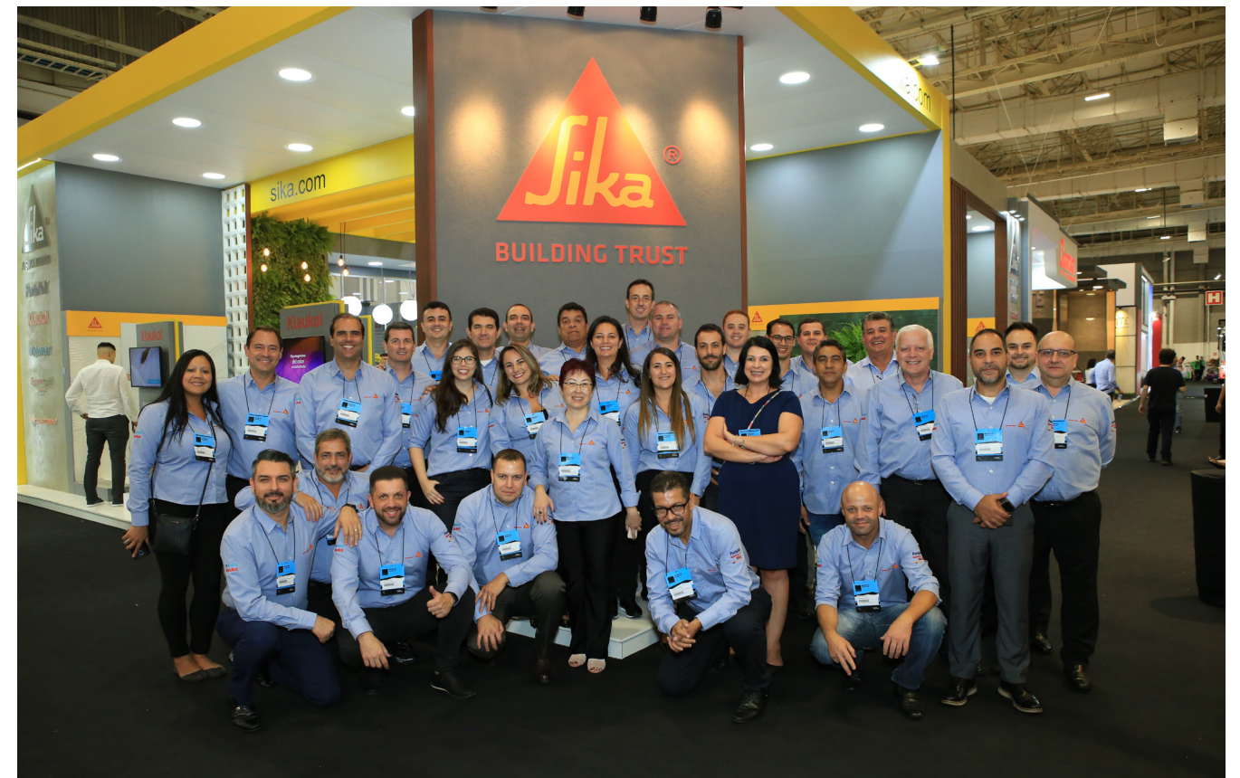
Sika and Parex teams from Argentina and Brazil worked together at the Revestir Expo, the major trade show in Brazil for architects and contractors

5 COMPANIES ALREADY FULLY MERGED IN ASIA/PACIFIC