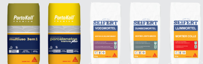
Further packaging examples of the first transition phases for the integration into Sika for PortoKoll (Brazil) and Seifert (Belgium).

PortoKoll in Brazil has a higher market share than Sika in the tile adhesives market. Moving to a transition branding phase will allow the market to get used to the Sika brand, which will support the development of the SikaCeram® tile adhesive product line as Sika plans to strengthen this product brand in Brazil and the whole region.