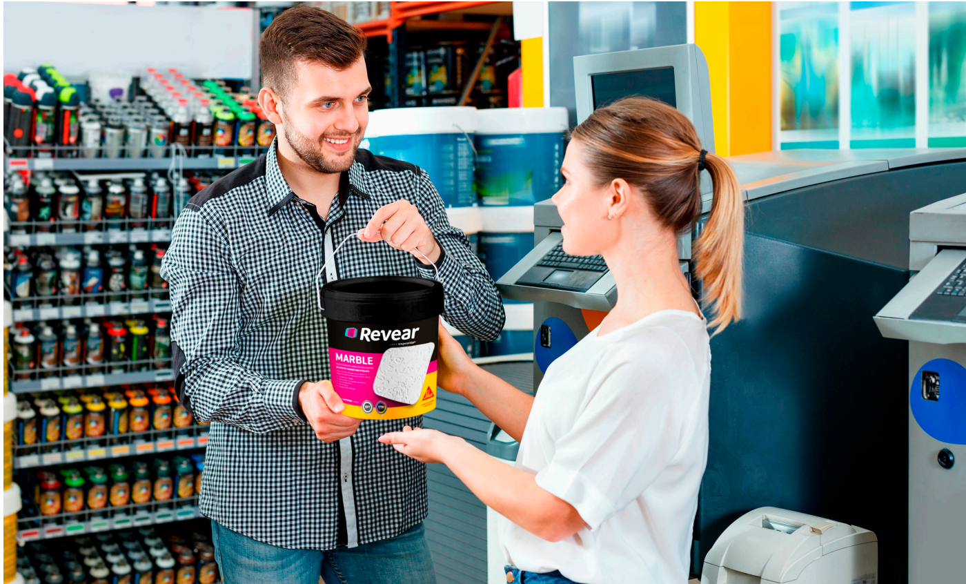
Reveal, a strong brand in Argentina in the paint business, specializing in textured finishes.

With the acquisition of Parex, 38 brands were added to the Sika portfolio and their internal integration has already begun. Over the next five years, most Parex brands and products are going to be integrated into Sika's product range. The next step is to plan and ensure a smooth transition "on the shelf".