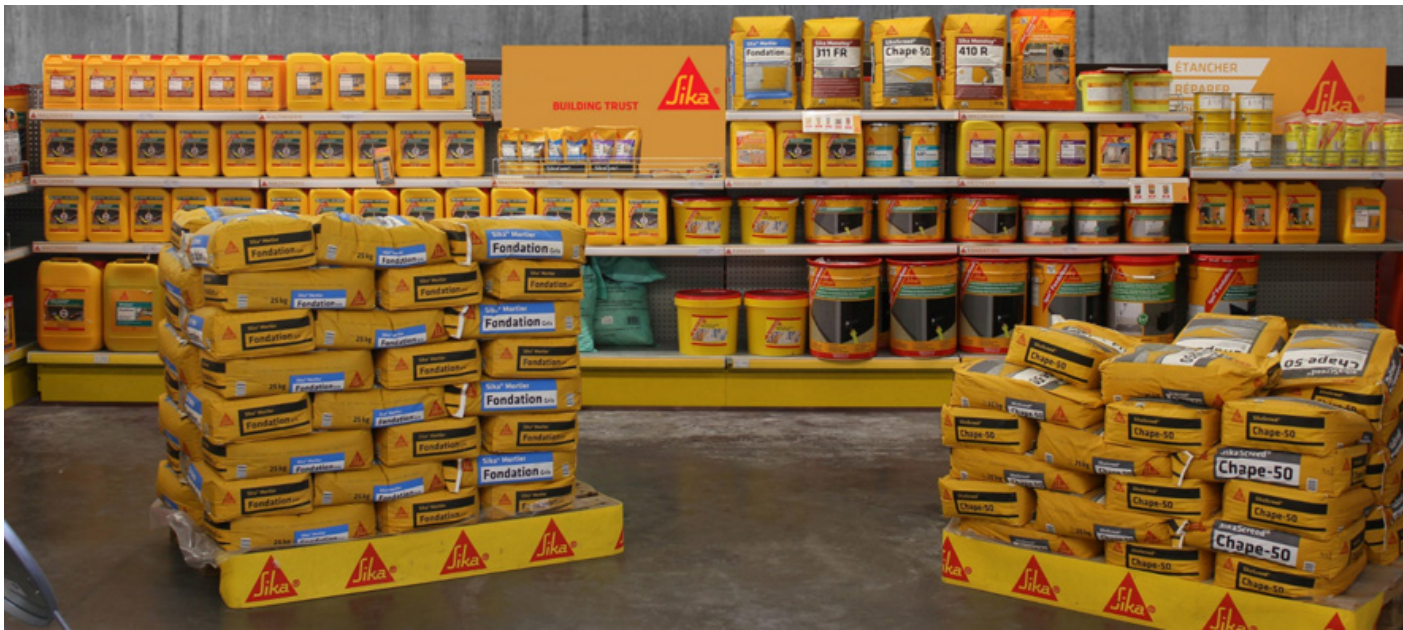
Sika shelf presentation for French distributors