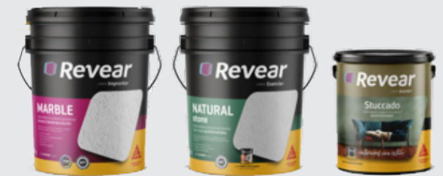
Reveal, a strong brand in Argentina in the paint business, specialized in textured finishes.

Reveal in Argentina is mainly sold in paint dealer shops, targeting a new type of end user for Sika: homeowners. For this segment, Sika is perceived as a technically oriented brand, while Reveal has more of an emotional brand image. The combination of Reveal and Sika will allow the two brands to benefit from each other's strengths and most important brand assets.