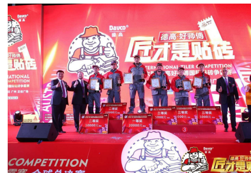
International tiler contest in Guangzhou, China, in November 2019

100,000 TILERS TRAINED WORLDWIDE EACH YEAR