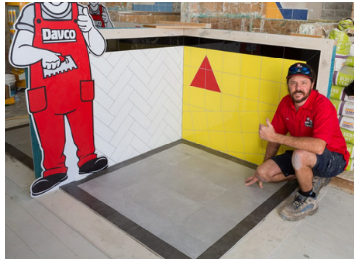
Tiler contest held in Sydney, Australia, in September 2019

At Sika we value tilers and aim to promote their talents and expertise, knowing that a successful project is a combination of a good product and a skillful applicator. Sika's distribution footprint within our 100 countries, combined with the experience and expertise of Parex with its close to 100,000 tilers trained worldwide each year, is supporting and driving efforts to bring the skills of the tilers to the next level.