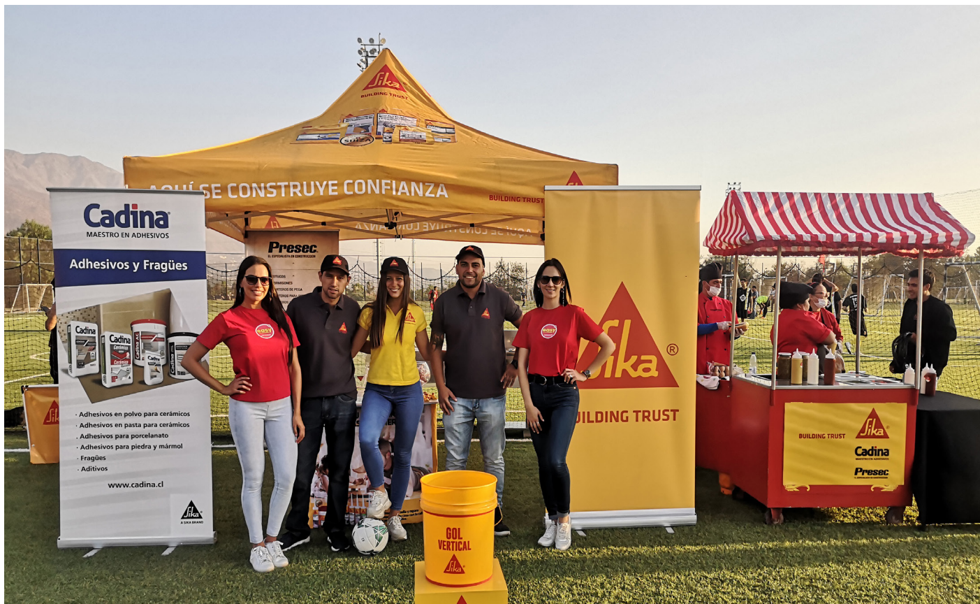
Sponsorship of a local football tournament organized by Easy, a major DIY distributor, and attended by their contractors and end-users