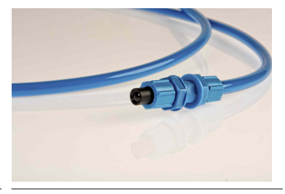
Option 2: For injection hoses under pressure: SPL W Lock Connection Cap 6mm (Art. 111994):