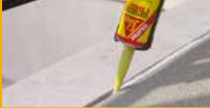
SEALING AND BONDING