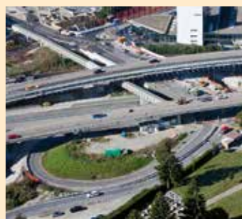
HIGHWAY BRIDGE A1, SWITZERLAND

Increasing of life cycle: Concrete repairs with Sika® MonoTop® system, concrete protection with Sikagard® hydrophobic impregnations.