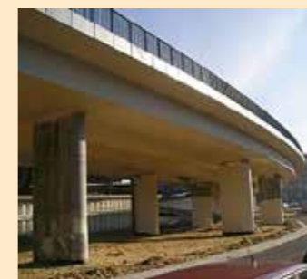
THE GALICYJSKA BRIDGE, POLAND

Long-lasting protection: Concrete protection with Sikagard® elastic and rigid protective coatings.