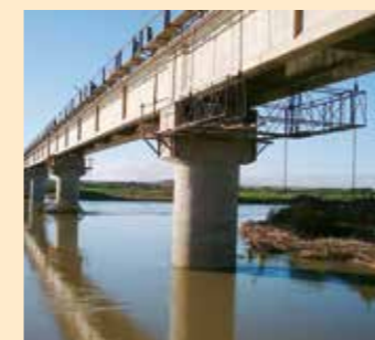
ERNEST OPPENHEIMER BRIDGE, S.A.

Increasing of durability: Repair & protection with Sika® MonoTop® repair mortars, Sika® FerroGard® corrosion inhibitor and Sikagard® protective coatings.