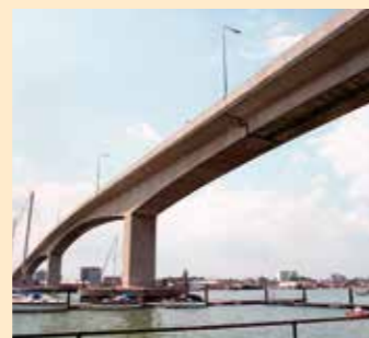
ITCHEN BRIDGE, UK

Protection of fair faced concrete: Concrete repair with Sika® MonoTop® system, concrete protection with Sika® FerroGard® corrosion inhibitor and Sikagard® hydrophobic impregnation.