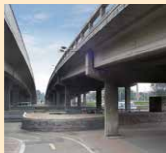
TWO BRIDGES IN COLUMBIA

Increasing of load capacity: Sika concrete protection systems Sika® FerroGard® corrosion inhibitor and Sika® Color® protective coatings.