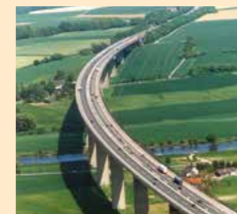
KÖRSCHTAL BRIDGE, GERMANY

Complete bridge maintenance: Full deck refurbishment of the bridge with SikaTop® repair mortars, deck waterproofing using Sika® Ergobit® system.