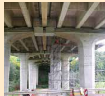
TOUTRY BRIDGE, FRANCE

Structural maintenance: Structural Strengthening during traffic load with Sika® Carbodur® systems, surface protection with Sikagard® protective coatings.