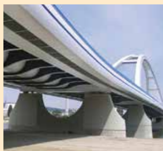
APOLLO BRIDGE, SLOVAKIA

Increasing of Durability: Waterproofing of bridge deck using Sika® Elastomastic TF system, long-term concrete protection with Sikagard® protective coatings.