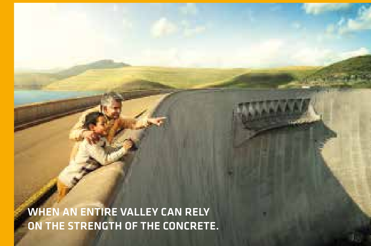
WHEN AN ENTIRE VALLEY CAN RELY ON THE STRENGTH OF THE CONCRETE.

We operate in seven different markets – concrete, waterproofing, roofing, flooring, sealing & bonding, refurbishment, industry – in both the construction and motor vehicle industries, providing high quality products and solutions anywhere in the world.