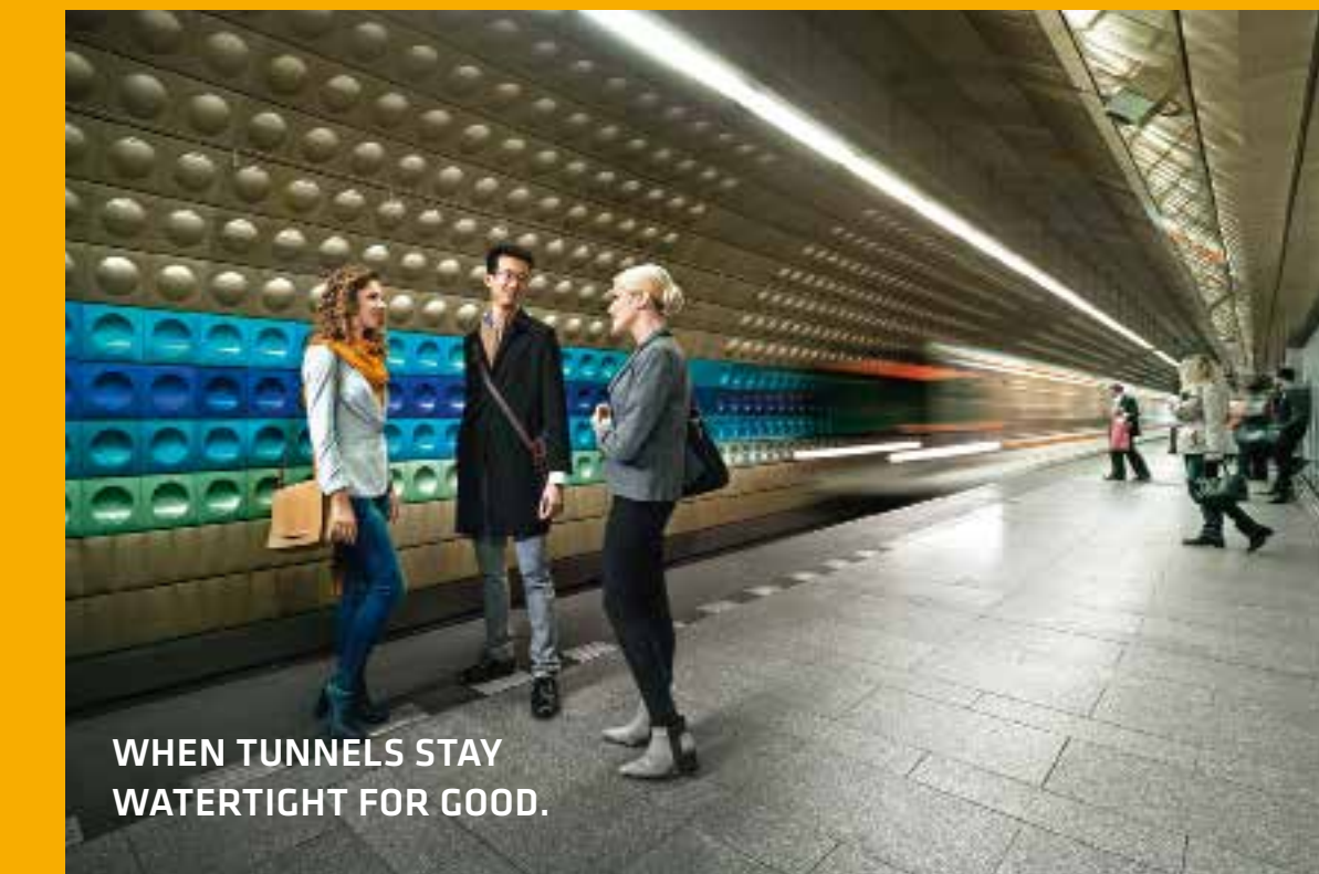
WHEN TUNNELS STAY WATERTIGHT FOR GOOD.