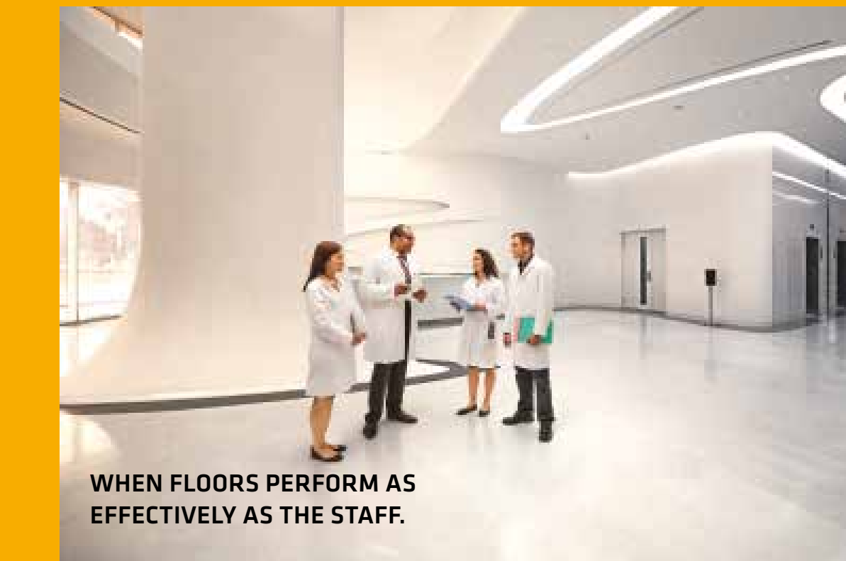
WHEN FLOORS PERFORM AS EFFECTIVELY AS THE STAFF.