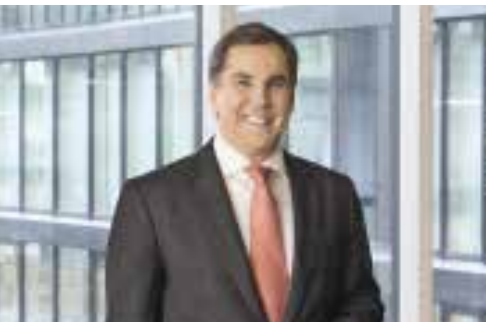
JAN JENISCH, CEO SIKA

We work with a four year strategy to increase our market penetration through the development of innovative new products, acquisitions of complementary businesses and accelerated growth in emerging markets. This, coupled with our Sika Values, will help us to achieve a steady annual growth and increased sales in new areas.