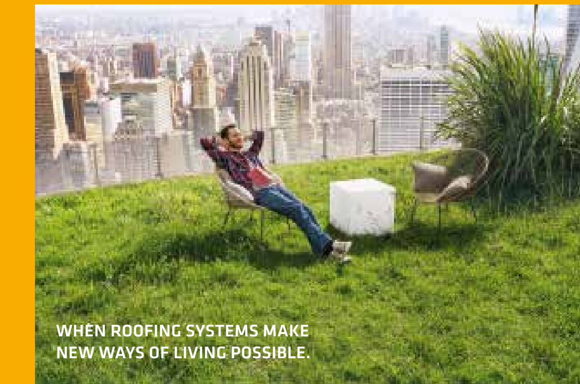
WHEN ROOFING SYSTEMS MAKE NEW WAYS OF LIVING POSSIBLE.