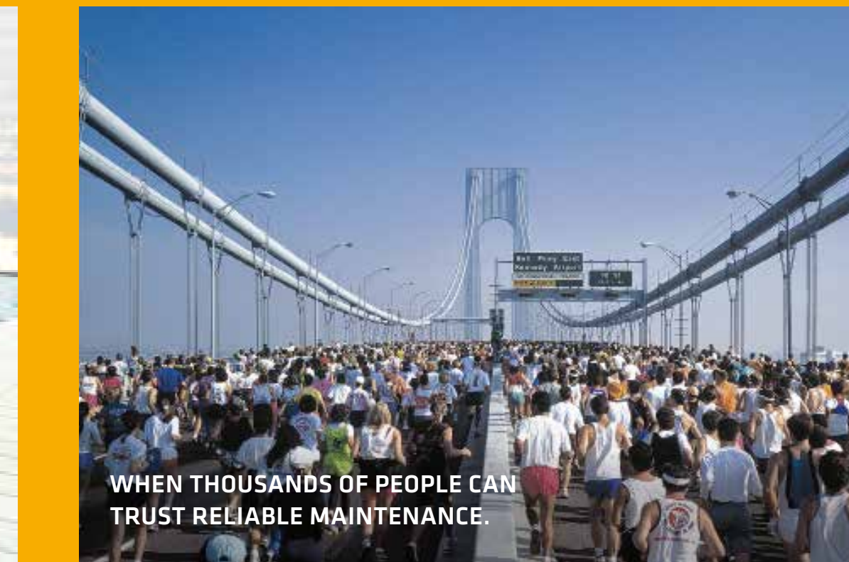
WHEN THOUSANDS OF PEOPLE CAN TRUST RELIABLE MAINTENANCE.