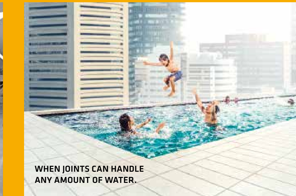
WHEN JOINTS CAN HANDLE ANY AMOUNT OF WATER.