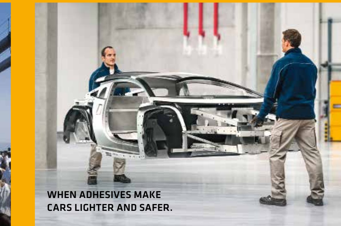
WHEN ADHESIVES MAKE CARS LIGHTER AND SAFER.